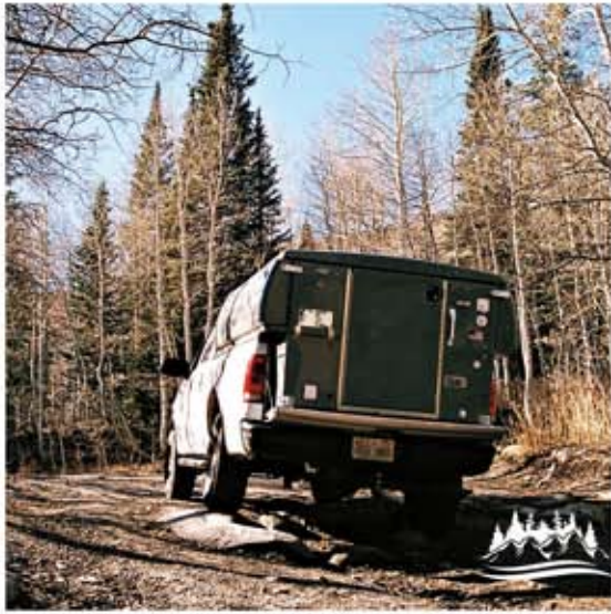
...Rough Backcountry Terrain