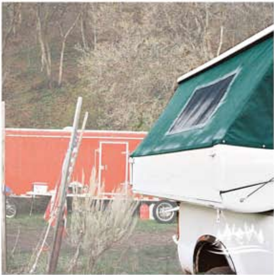
...the Weekend Warrior